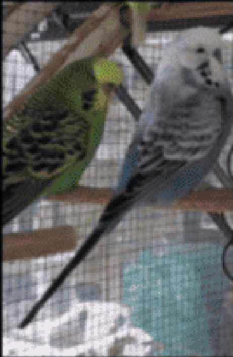
SADDLEBACK WITH NORMAL