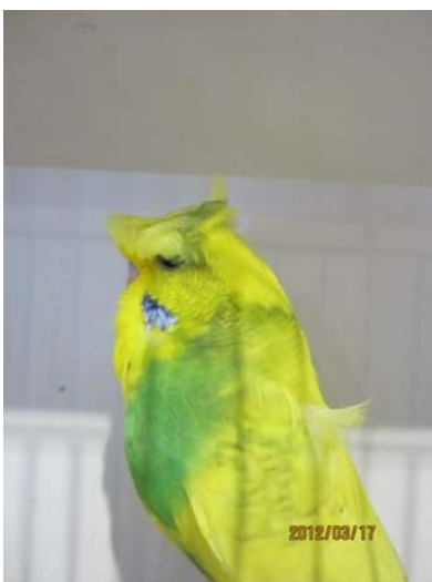
Best Crested Robin Hood