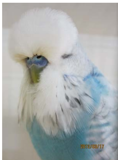
Best Derby Bird O'Callaghan Family