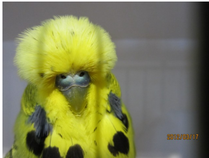
Grand Champion Of Show – O'Callaghan Family